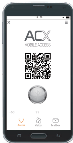
Unlock Mailbox Door via Scramble QR Code or Bluetooth